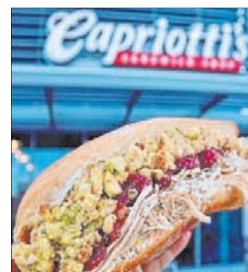
Bobbie sandwiches from Capriotti's will be among food items given away at The Swoop Building opening Feb. 20.

the superstar. It starts with an 8-ounce patty of "Kobe" beef (technically American wagyu), in recognition of Bryant's first jersey number as a Laker. Other touches include goat cheese (a reference to "greatest of all time"), purple onions and yellow tomatoes, five golden onion rings and something called "mamba sauce." And 24 percent of the $19.95 price is being donated to the cause, a nod to his later jersey number.