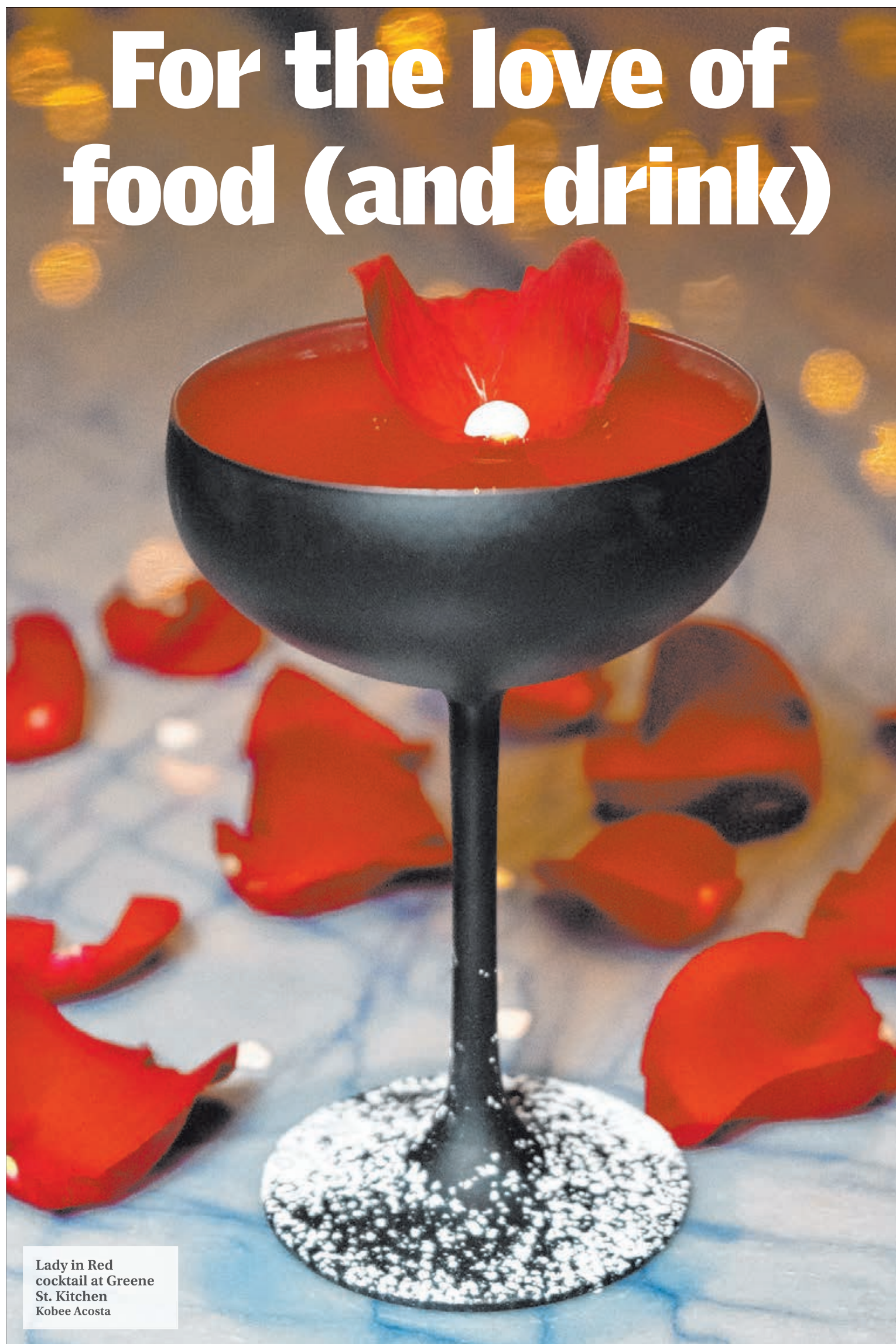
Lady in Red cocktail at Greene St. Kitchen Kobee Acosta