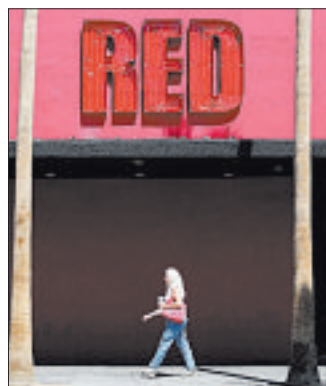
A woman walks in front of Red, a new nightclub on Fremont Street taking the place of Insert Coin(s), which closed in July 2015.