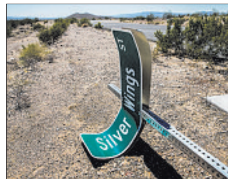
A broken street sign marking Silver Wings Street at the Searchlight Airpark subdivision is a sign of the times.