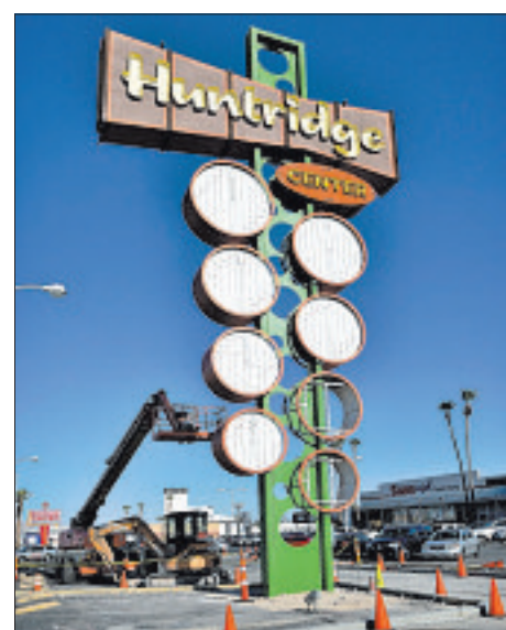
Work continues Thursday on a new sign being built as part of the renovations at the Huntridge Shopping Center.